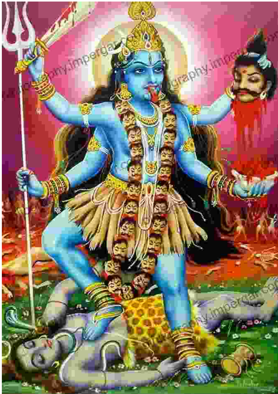
The Great Kali: Goddess Of Time (The Hindu Pantheon Series Book 8) by Kiran Atma